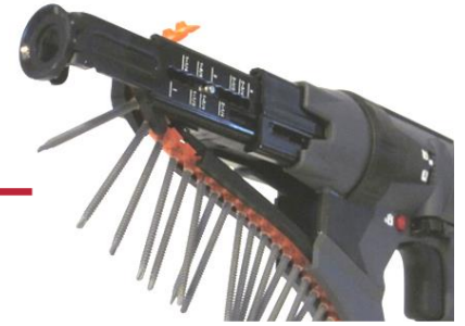
*Bullseye® Auto-feed System