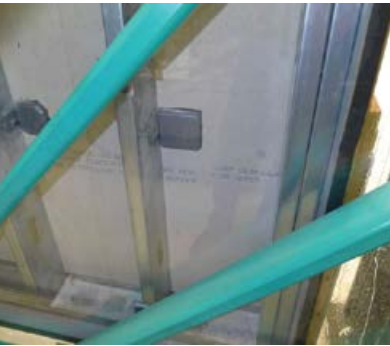
Backside of transparent test rig showing inside of the stud wall and sealed perimeter. Pressure differential is created behind the test wall to simulate moisture drive through the test wall specimen.