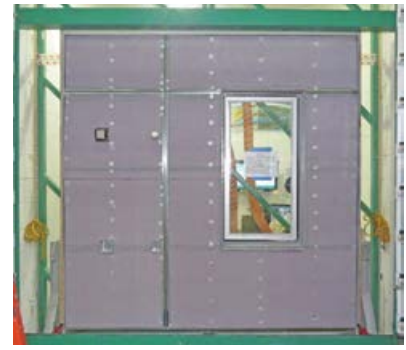
Lath attached over 2-inch rigid continuous insulation using large 1¼-inch diameter. Lath and plaster washers and corrosion resistant ceramic coated self-drilling screws; 8-foot by 8-foot test wall has been strapped to transparent test rig for E-331 moisture test.