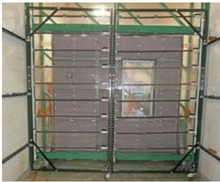
Lath attached over 2-inch rigid continuous insulation using large 1¼-inch diameter. Lath and plaster washers and corrosion resistant ceramic coated self-drilling screws.

In the case of a stucco test wall, the lath is applied along with the necessary control joints and terminations. The test wall bucks are strapped to a transparent wall and sealed around the perimeter. A calibrated and continuous amount of water is then sprayed on the outside surface of the wall assembly while a pressure differential is created inside of the wall simulating moisture drive through the assembly. Observers stand behind the