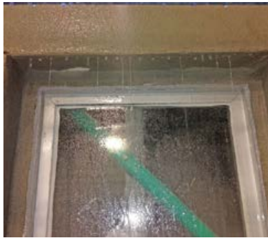
Stucco test wall on the water spray rig.