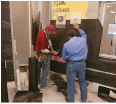
Building paper being applied to the base test wall and integrated with mechanical and window penetrations.