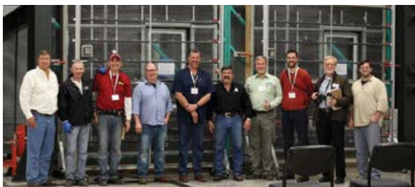
Members of the cross-section group of industry experts including stucco wall component manufacturers, industry advisors and inspectors, lath and plaster bureau directors, and building science engineers.

Stucco walls are constructed differently in different parts of the country and local labor may find it challenging to adapt to these changes. Given the complexity and the sheer number of unique building component options along with the impossibility of testing every conceivable configuration, the stucco industry will undoubtedly see a trend towards systemization. System-