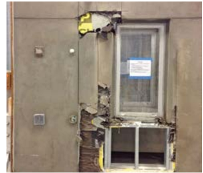
Test wall being investigated to determine source of moisture penetration after the water test.

ization will consist of entire stucco wall solutions being clearly specified and detailed, fully tested, code compliant, and perhaps even warrantied.