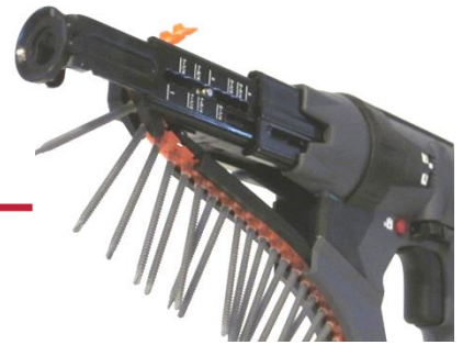
*Bullseye® Auto-feed System