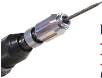
*EZ-Driver Chuck Adaptor