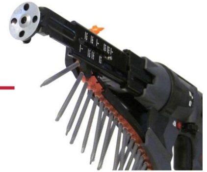
*Bullseye® Auto-feed System