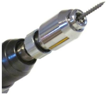
*EZ-Driver Chuck Adaptor