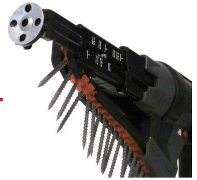
*Bullseye® Auto-feed System