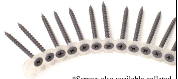
*Screws also available collated