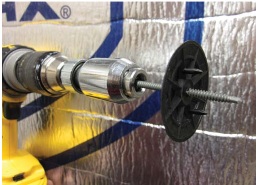
Insulation fasteners need to seal against air and moisture penetration.