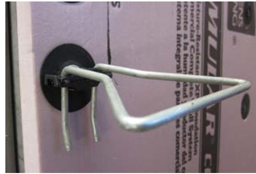
Masonry veneer anchors with sealing washers ensure a weather-tight envelope.

Important things to consider include: Is the CI being applied over gypsum sheathing and a weather resistant barrier or directly to the steel studs or concrete? Which washers and screws and how many fasteners are required per board for proper attachment? Do the joints of the board and the fasteners require tape for weatherization? What is the specified method to flash door and window penetrations, pipes, outlets, etc.? All of these are critical installation details that should have been addressed and tested as an assembled system. Next time you are asked to “value engineer” something as important as the building envelope keep in mind that until each component has been fully system tested in a wall assembly, there is no such thing as “or equal.”