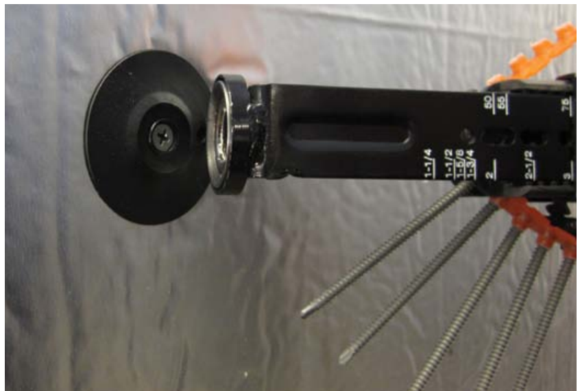
Attachment of ci to steel studs is easy with the proper fasteners and tools.