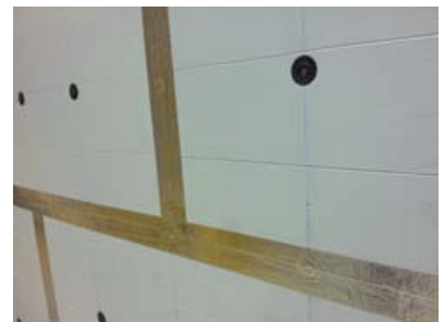
Special tape and self-sealing fasteners area required to maintain air and moisture barrier.

Not all rigid or continuous insulation is created equal nor is there a "one size fits all" solution. Rather, the architect or building designer has to consider thermal performance, vapor permeance, fire resistance, moisture absorption charac-