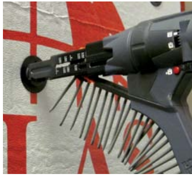
Tools and adaptors ensure consistent fastener depth and prevent overdrive.